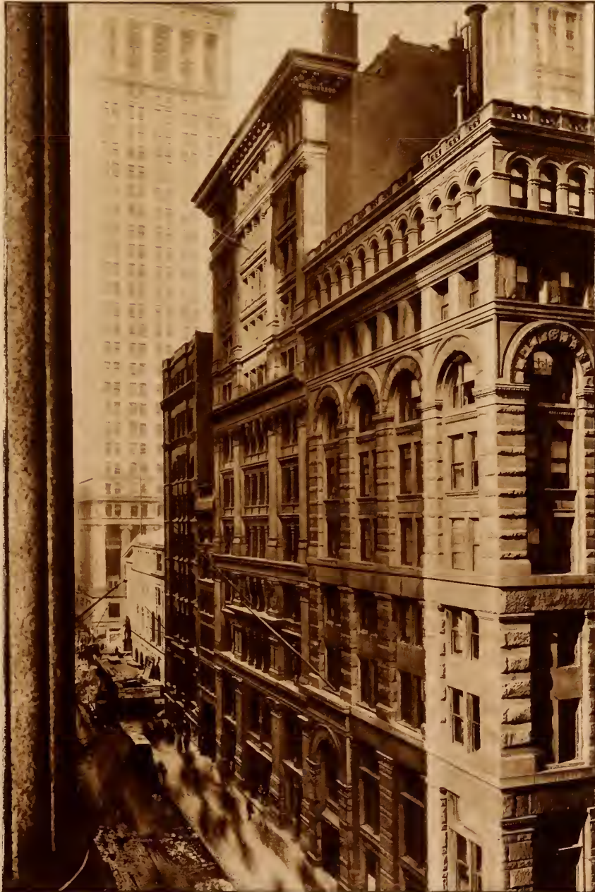
MERCHANTS NATIONAL BANK.